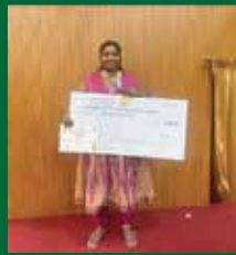
First Prize in District Level Chief Minister's Trophy Badminton Tournament