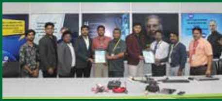
Memorandum of Understanding