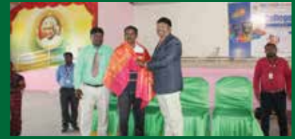
International Yoga Day 2023