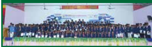
Jubilant Day 2023