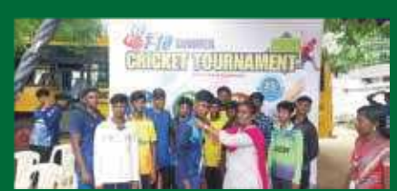
T - 10 Cricket Tournament