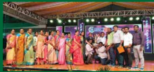
SCAD Family Day - Founder's Day