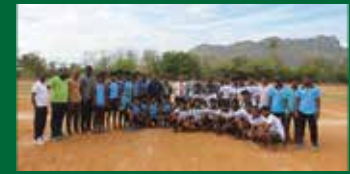
Anna University Zonal Kho-Kho tournament