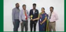
Best Fielder in Zone 18 Inter College Cricket Tournament 2023-2024